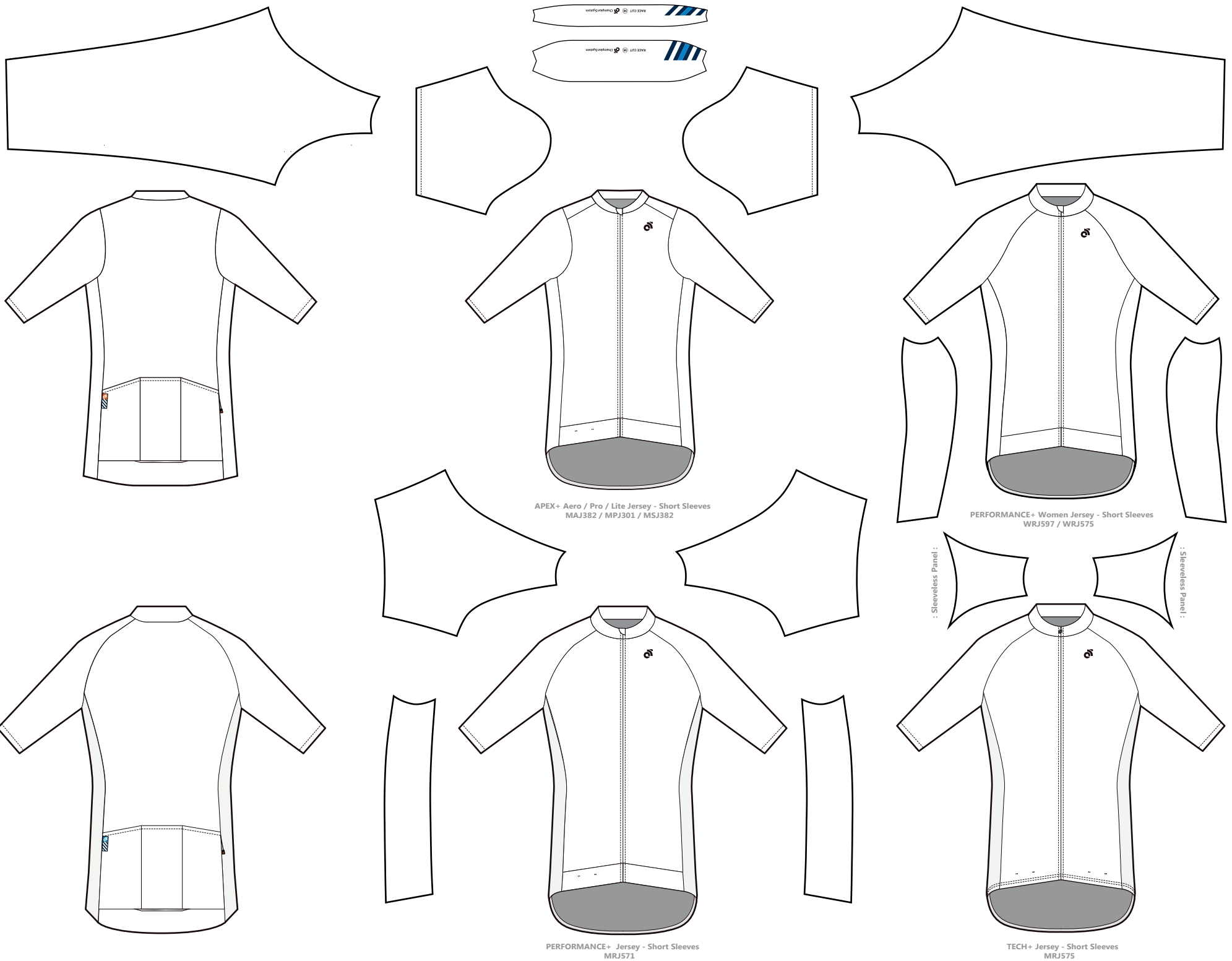
APEX+ Aero / Pro / Lite Jersey - Short Sleeves MAJ382 / MPJ301 / MSJ382