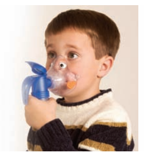
BUBBLES THE FISH II™ PEDIATRIC AEROSOL MASK PART NO. 44F7248