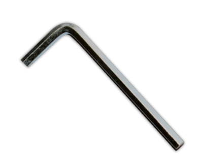
4MM ALLEN KEY