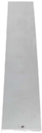
1 - Smart Flat Bar™