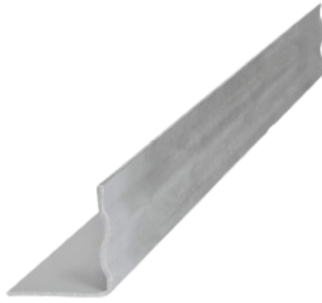
2 - Smart Angle™