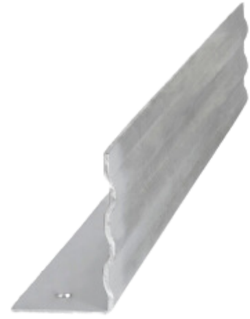
3 - Smart Angle™