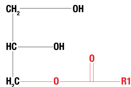
Figure 1. Monoglyceride Chemical Representation in MaxSimil Fish Oils (R1 = fatty acid)

The MaxSimil PLATform is a novel monoglyceride delivery system that enhances absorption of lipid-based and lipid-soluble nutraceutical and food ingredients. This technology has been applied to Company Name's Omega Plus formulas in order to create a unique vehicle by which to deliver EPA and DHA. Due to the fact that monoglyceride oils are intrinsically emulsifiers and are, by nature, in a readily absorbable form, they can bypass the body's normal fat digestion process. These qualities make Omega Plus an excellent method for delivering omega-3 fatty acids, especially to individuals with digestive, pancreatic, or gall bladder challenges. Studies show that MaxSimil fish oils (FO) have three times (300%) greater absorption of EPA and DHA compared to other leading fish oils.* [1-3]