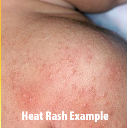
Heat Rash Example