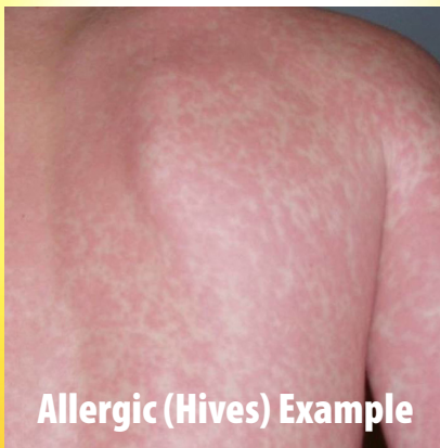
Allergic (Hives) Example