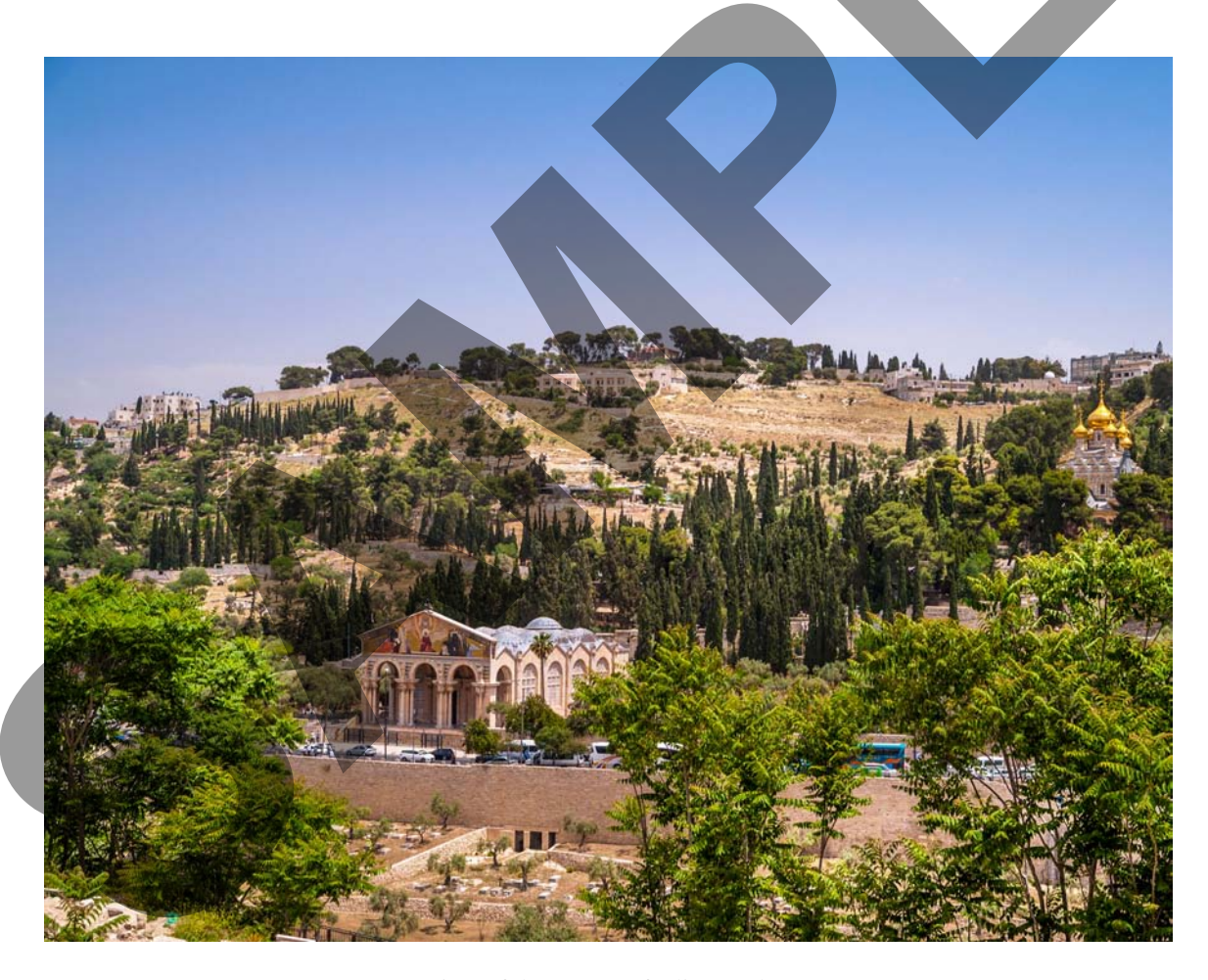
View of the Mount of Olives today.

The Eighth Stage: The Victory Ascent upon the Mount of Olives (Zechariah 14:4-5). With the fighting ending in the valley, Jesus will then have a victory ascent upon the Mount of Olives. With that ascent, the Tribulation and Armageddon come to a close. His ascent causes a tremendous earthquake that will destroy the current Jerusalem and create a new valley at the Mount of Olives. That will, in turn, provide a way of escape for the Jews still in Jerusalem to flee the earthquake.