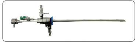
Hysteroscopic Operative Sheath, Contributions With 2 Detachable Suction Irrigation Plugs For 4mm & 2.9mm 30' Scope