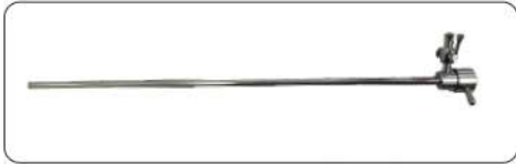
Hysteroscopic Examination Sheath With Atraumatic Distal End & Rotatable Stop Cock For 4mm & 2.9mm 30' Scope