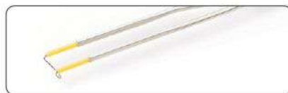
Electrode Cutting Loop,