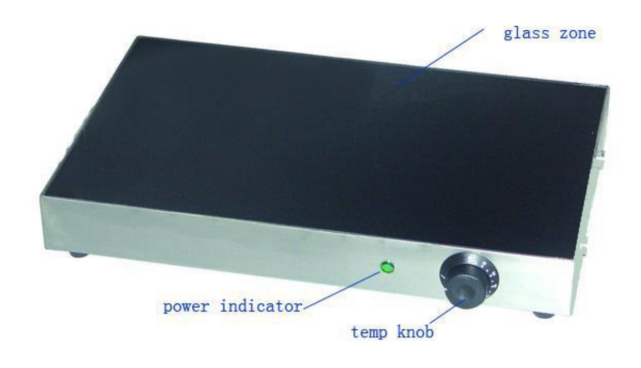
TC-1: ONE GLASS ZONE TC-2: TWO GLASS ZONE