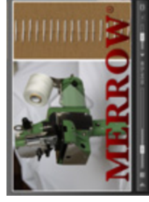
Hand-Held, Portable Seaming