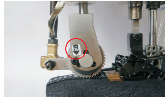
3 Lubricated Rear Puller Device Design

750W direct saver motor, compared with the clutch motor, more accurate to control mechanical structure. Also it is power saving and high efficiency machine.