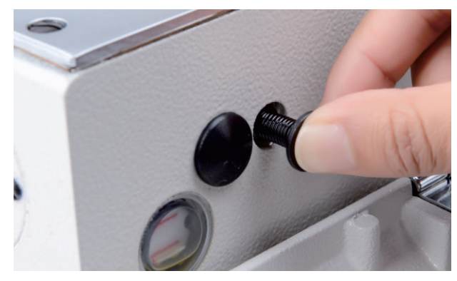
6 Stich length adjust button. Widely used with different fabric.

The needle position is always in upside. Convenient to sewing, needle exchanging and thread making.