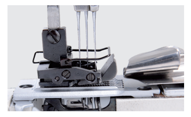
5 Removable needle guard, beautiful stitch.

Realization of the rear puller lubricated makes the rear puller lubricate continuously, which extends the life of rear puller a lot