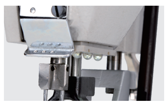
7 LED light

The button can adjust the stitch length easily to satisfy many different requirements.