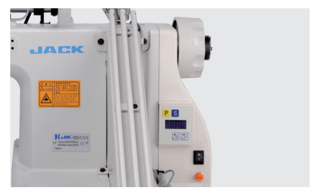
1 Direct Drive, High Efficiency

750W direct saver motor, compared with the clutch motor, more accurate to control mechanical structure. Also it is power saving and high efficiency machine.