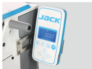
Dot Screen, easy Operation