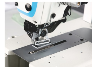
Wide Rang Of Applications, Beautiful Stitches