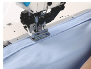
Short Thread Remaining, No Need Thread Timmer Again