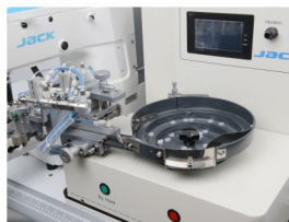
Automatic button feeding

shirts, suits, pants, down jackets, etc.