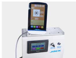
Easy operation easy using