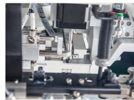
Pressure foot protection, safe and reliable