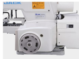
Integrated, Power Saving And Environmental Protection