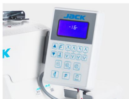
Lcd Operation Panel, Easy To Use