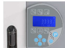
Voice guide, one key to reset.