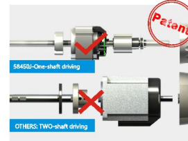
One main shaft, stable and fast.