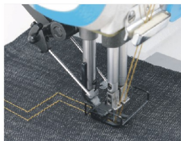
Auto corner sewing.

Umbrella, denim, T-shirt, etc. with chain stitching