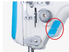
Intelligent Double Switch