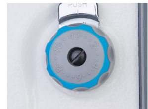
Super Large Needle Gauge, Suitable for Light and Heavy Duty