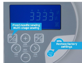
Full Function Panel, Easy to Operate