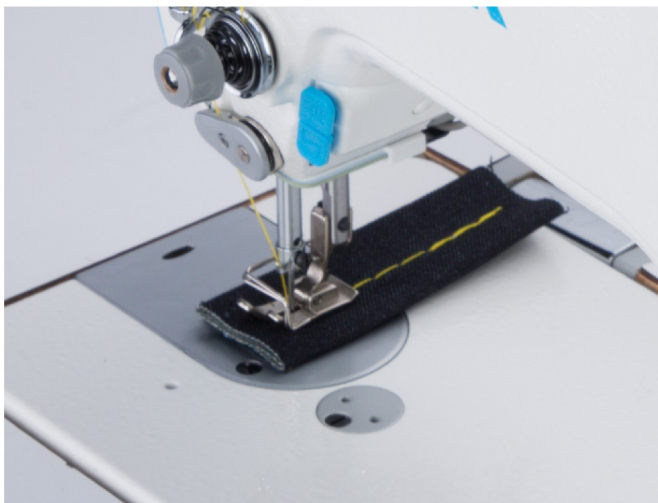
Top And Bottom Feeding, High Efficiency

Shirts, jeans, non-woven bags, magic tape, shoes, bags, etc.