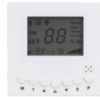
Optional Remote Control