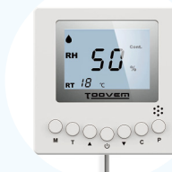
Optional Remote Control

EFFICIENT · INTELLIGENT · COMPACT HOMES · STORES · STORAGE AREAS