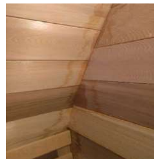
Normal Water seepage

To minimize seepage, select a location for your sauna that is under cover, or choose one of our roofing options.