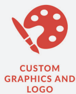
CUSTOM GRAPHICS AND LOGO