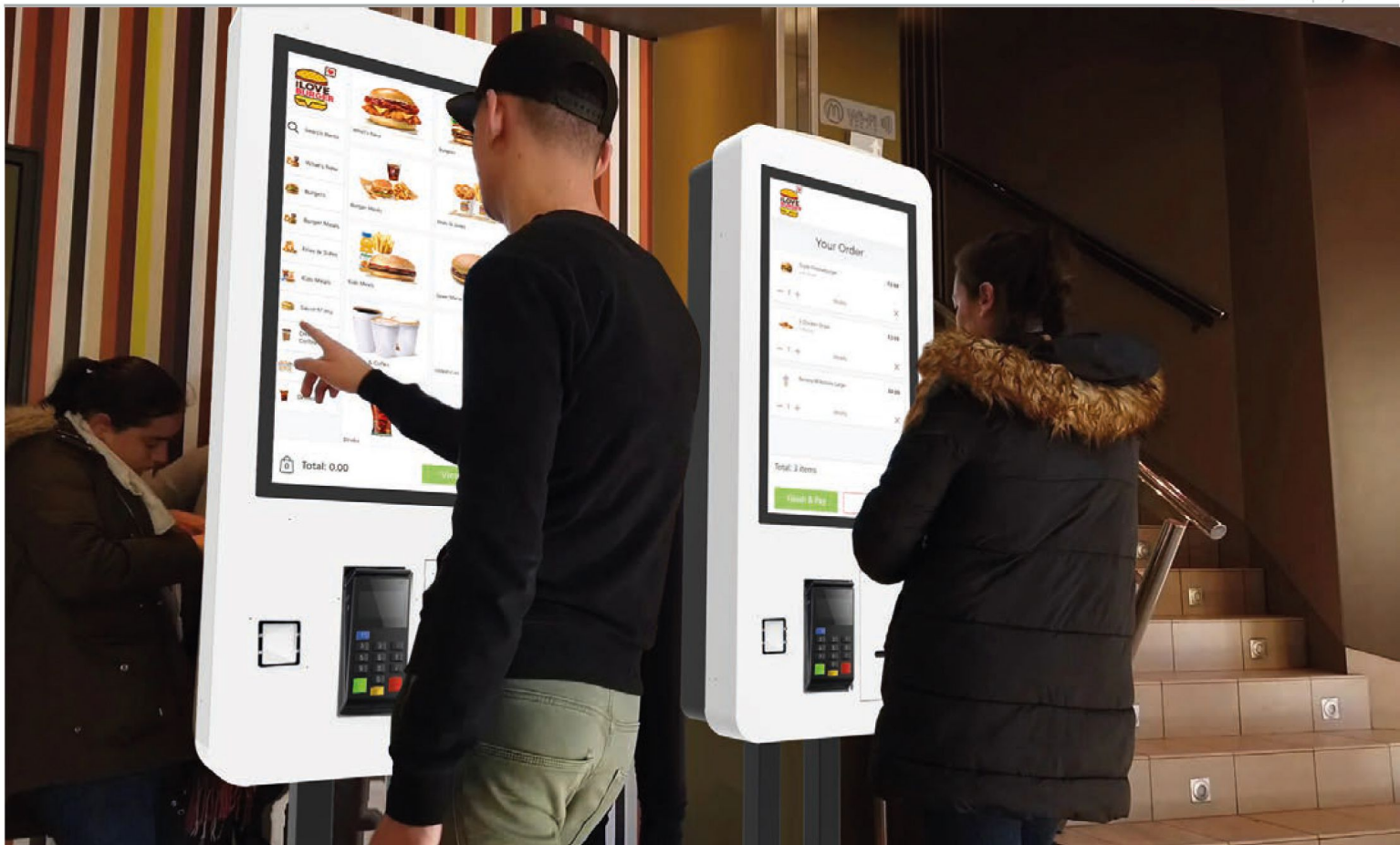
Self-ordering touch screen solution for quick service restaurants with integrated QR code scanner and receipt printer