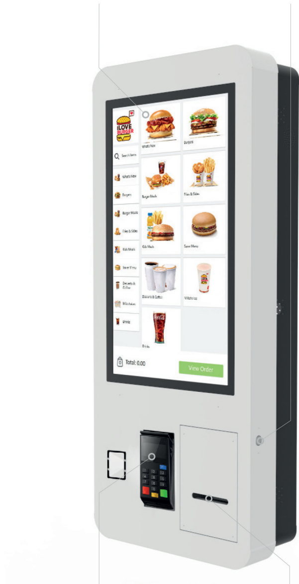
OPTIONAL NFC CARD READER