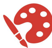
Custom Branding & Logo

Other sizes and colours are available on request. We can also design and manufacture bespoke units with an integrated camera or double-sided versions. For existing models we offer a coloured vinyl wrap service as well as custom logo and graphics.