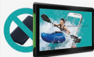
NO INTEGRATED BATTERY