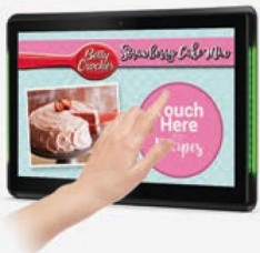
10 TOUCH POINTS