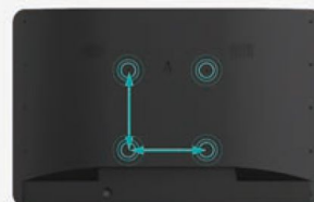
VESA MOUNTING HOLES