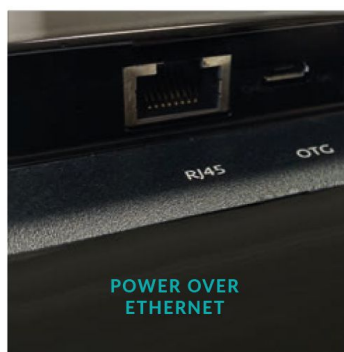
POWER OVER ETHERNET