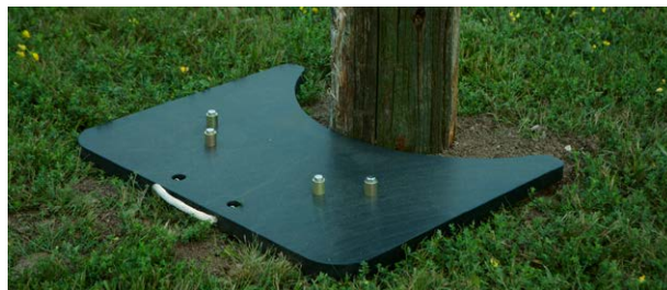
Pole Puller Pad provides greater surface area to resist forces of the ram and prevents base plate from kicking back during operation. SOLD SEPARATELY