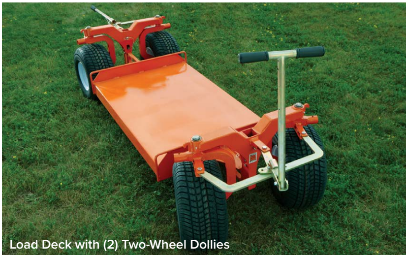
Load Deck with (2) Two-Wheel Dollies