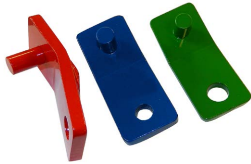
Available Sizes: 1/2", 5/8" & 3/4" Rod Diameter