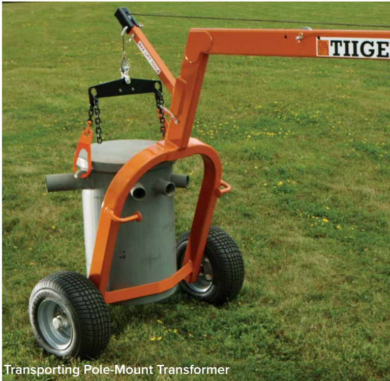
Transporting Pole-Mount Transformer