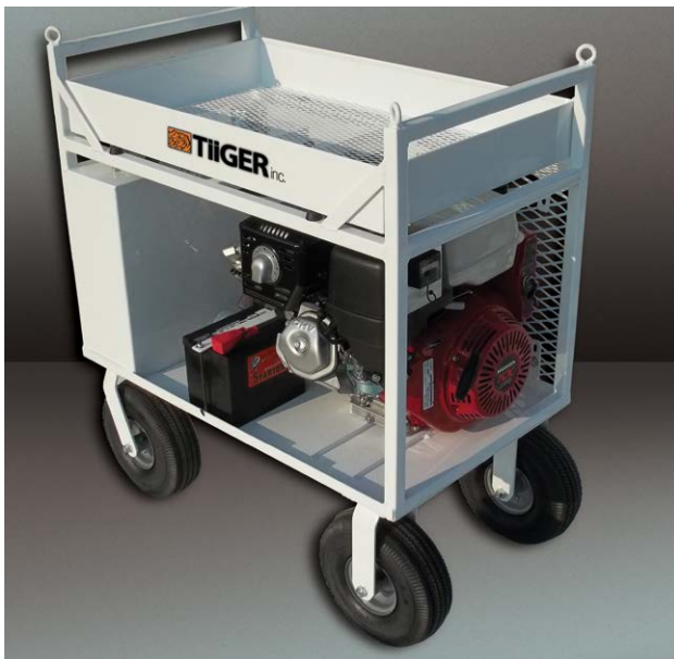
Cube II and III