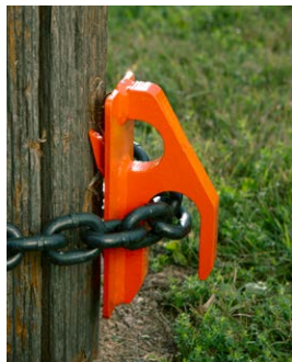
Back Plate prevents chain roll-up and slippage.