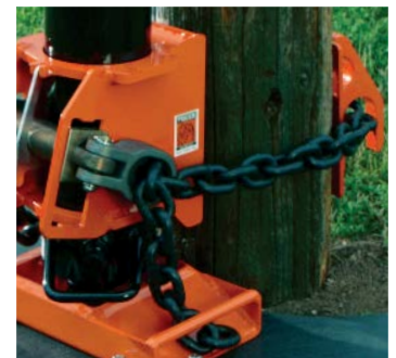
Swivel chain hook assembly is used to pre-tension chain to provide maximum lift per stroke.