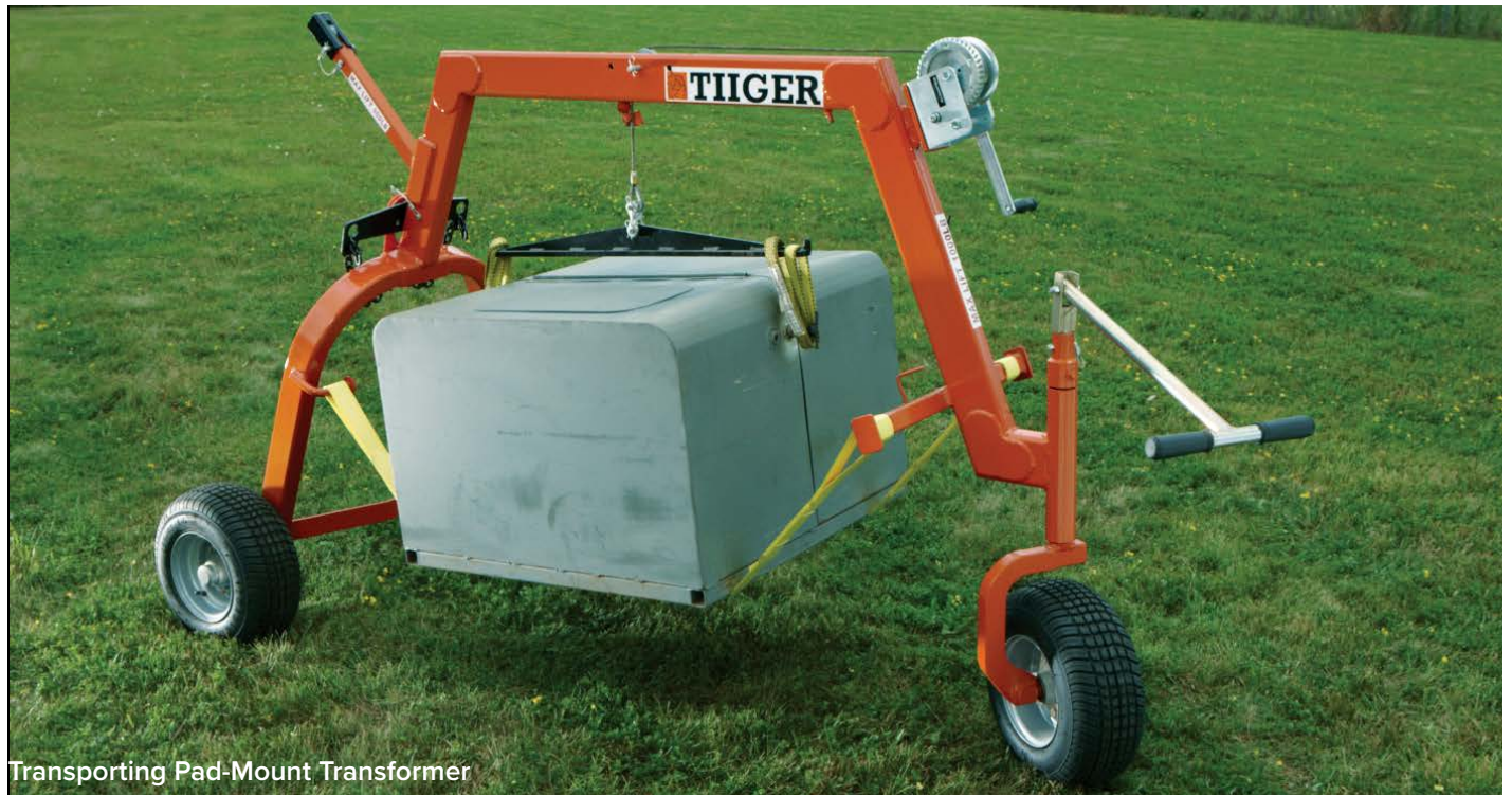
Transporting Pad-Mount Transformer