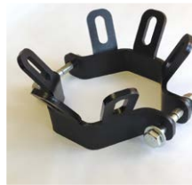
Ring Clip Collar Included With Auger-Up