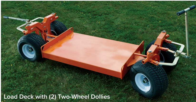
Load Deck with (2) Two-Wheel Dollies