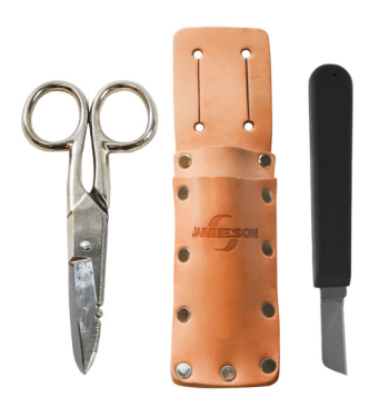
CABLE SPLICER'S KIT, SLOTTED LEATHER POUCH (3-PIECE)