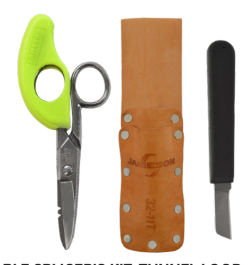
CABLE SPLICER'S KIT, TUNNEL LOOP LEATHER POUCH (3-PIECE)