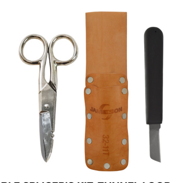
CABLE SPLICER'S KIT, TUNNEL LOOP LEATHER POUCH (3-PIECE)