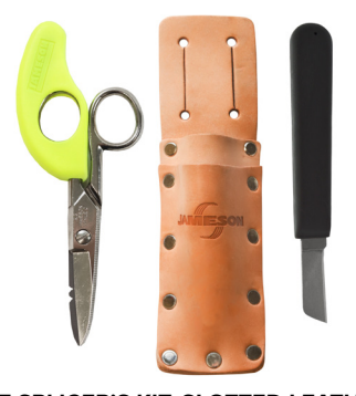
CABLE SPLICER'S KIT, SLOTTED LEATHER POUCH (3-PIECE)