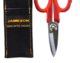
ELECTRICIAN FIBER OPTIC SCISSORS, 5-1/2 IN.