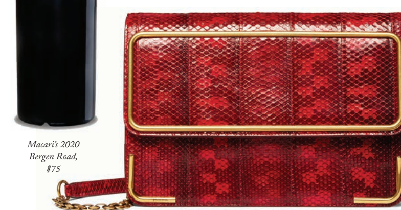
Macari's 2020 Bergen Road, $75