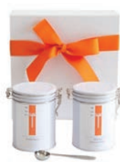
PLAIN-T's Relaxing Gift Set, $55