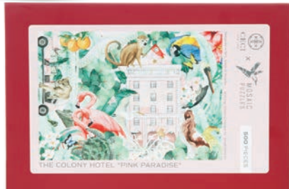
The Colony Hotel Puzzle by Ceci Johnson, $175