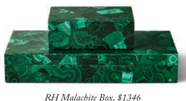
RH Malachite Box, $1346