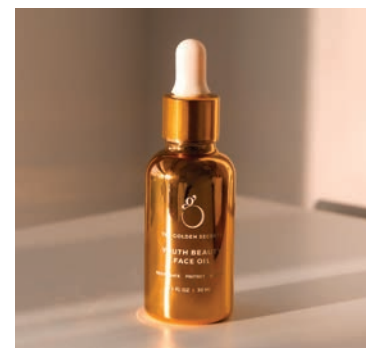
The Golden Secrets Youth Beauty Face Oil, $111