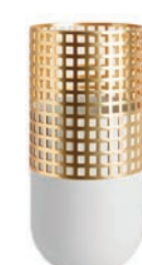
Mia Tall Vase from Singulart, $370