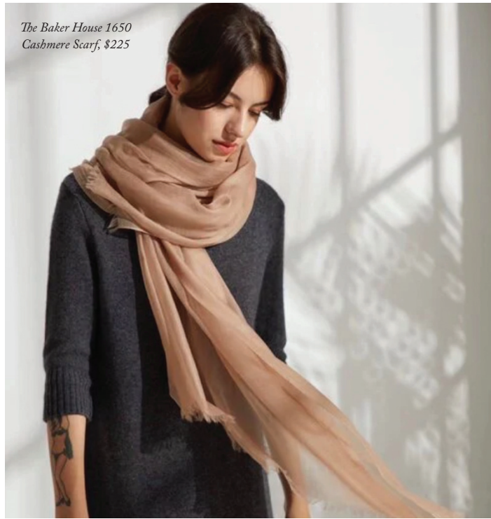
The Baker House 1650 Cashmere Scarf, $225

Just a few of our favorite things this holiday season.