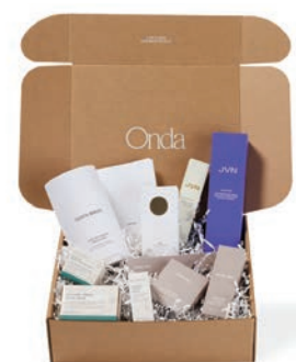
Onda Discovery Holiday Box, with products from popular brands like JVN Hair and Biossance, and 5% of proceeds from the box will go to charity, $165