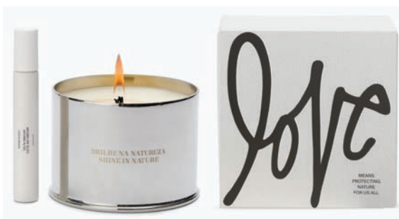
Costa Brazil Home & Away Duo, including the Vela Jungle Candle and the Aroma in Oil, $175