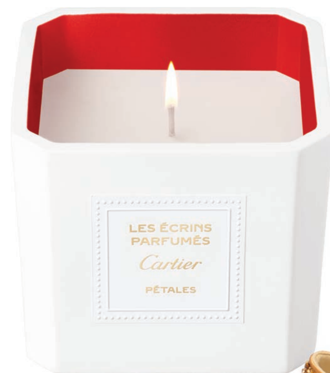
Les Écrins Parfumés Cartier Pétales, Scented Candle 7.7 oz, $200