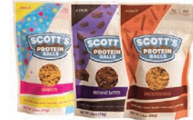
Scott's Protein Balls Sampler, $19.99