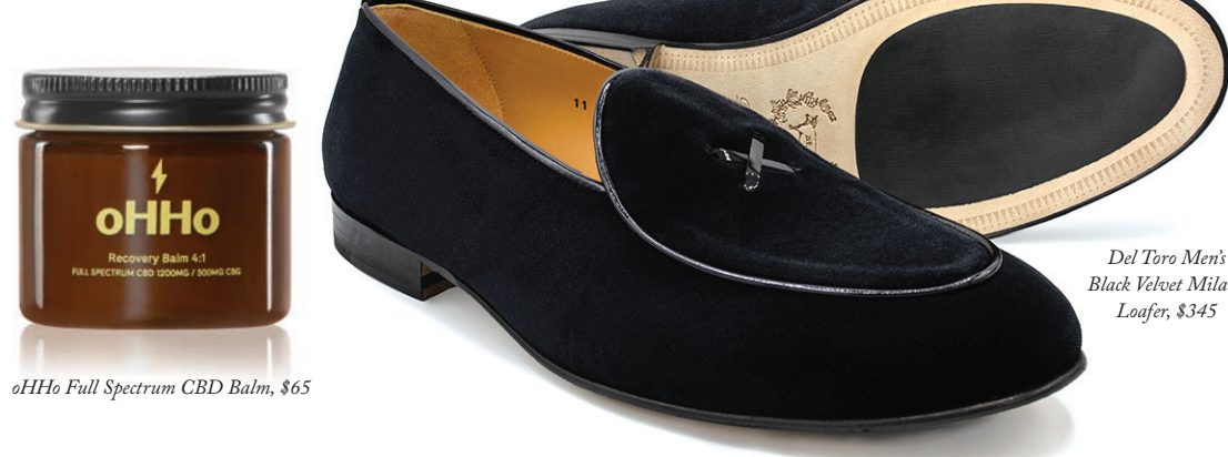
Del Toro Men's Black Velvet Milano Loafer, $345