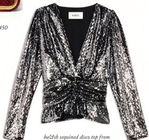
ba&sb sequined disco top from North Fork Apothecary, $260