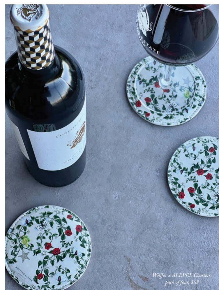
Wülfer x ALEPEL Coasters, pack of four, $68