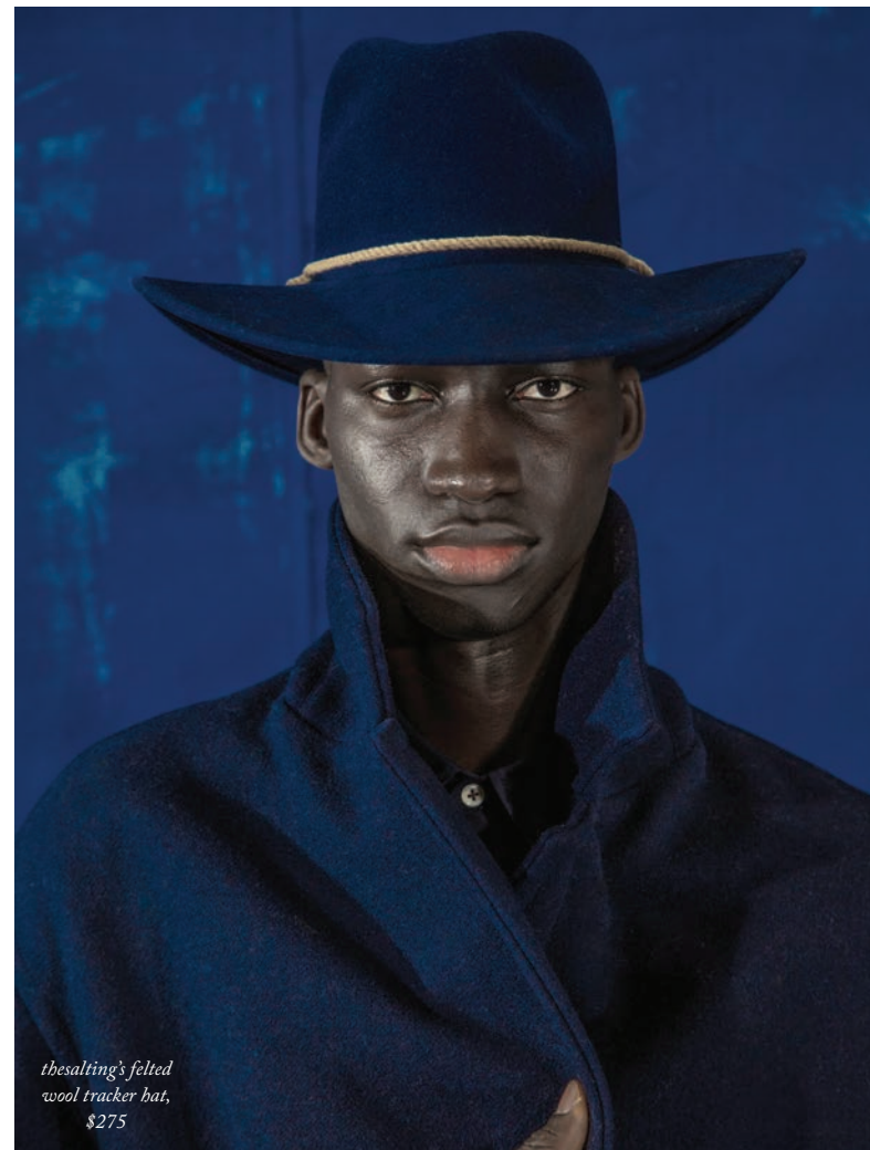
thesalting's felted wool tracker hat, $275