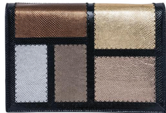
Sharon Wilkes Black Classic Natalie, $525