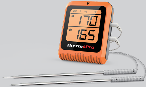
Bluetooth Remote Dual Probe Meat Thermometer

According to the operating system of your mobile, scan the following QR code to download and install.