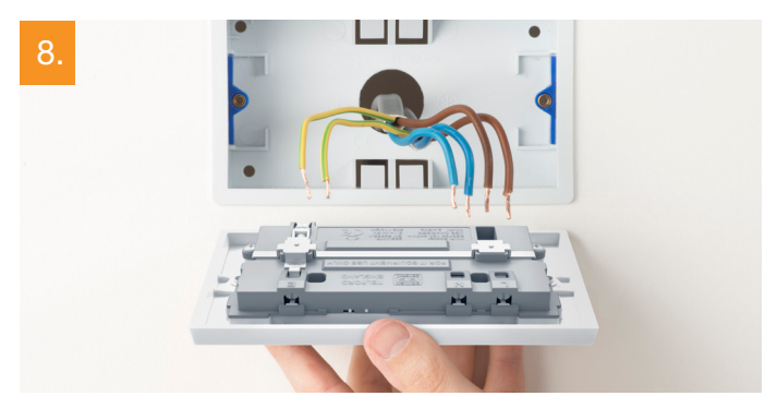
Line up the new socket and take note of where each terminal is located.

Alternatively, there could be two or three wires of each colour connected to each terminal.