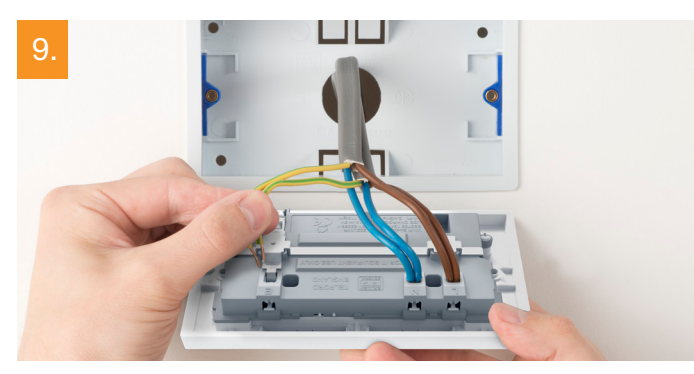
Place the blue wire(s) into the neutral terminal, brown into the live terminal and green/yellow into the earth terminal. The terminals on the socket are colour-coded to help locate the correct one.