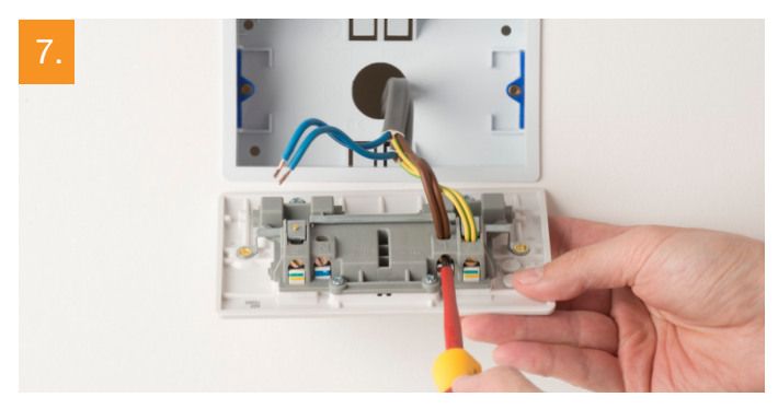
Whichever wiring configuration you find, unscrew each terminal screw to release the wires. You should now be able to remove the socket and place it to one side.

There will generally be three different wiring configurations. This photo shows a single wire of each colour connected to each terminal.