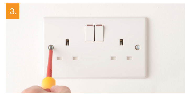
Test power is not supplied to the socket by using a plug in socket tester or multimeter. Unscrew the retaining screws on the socket so that it is released from the mounting box.

To start, make sure you are familiar with the safety warnings in this leaflet, the instructions supplied with the product and the mains supply is turned off.