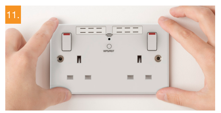
Gently press the socket back into place over the mounting box. Take care not to trap any wires between the wall and the socket.