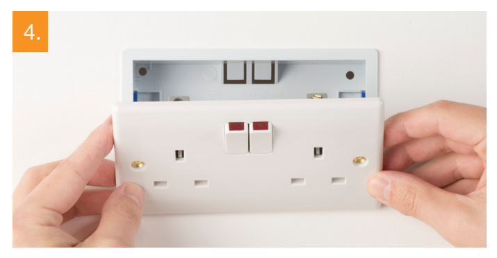
Gently ease the socket from the mounting box to show the wiring.

At the consumer unit, find the trip switch which protects the circuit and turn it all the way off. The indicator window should stay green.