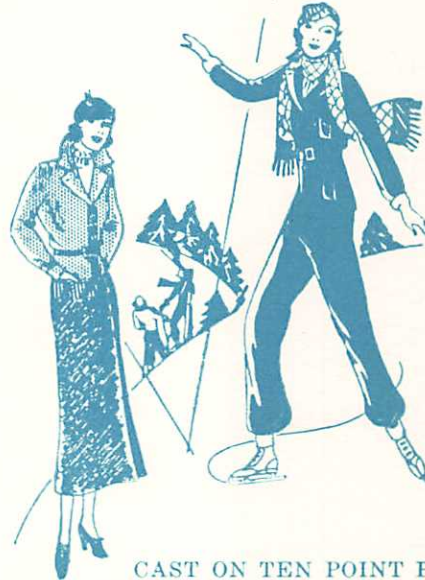
CAST ON TEN POINT BODY