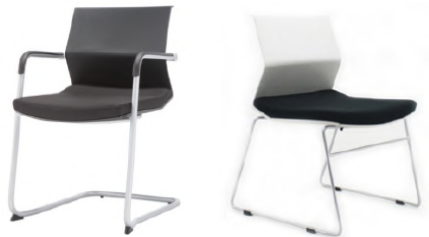
silver spray arch foot frame