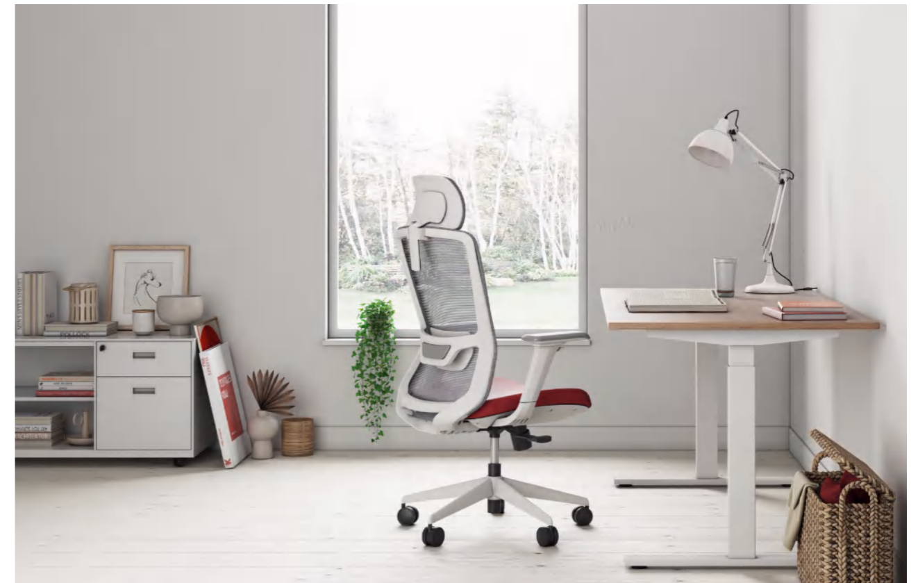
VOGUE x STAND DESK