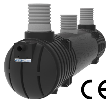
Item number: 224512000