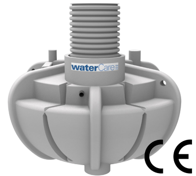
Item number: 223192651