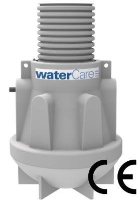
Item number: 223191651