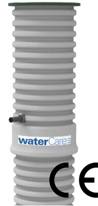
Item number: 223190735