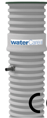
Item number: 223190730