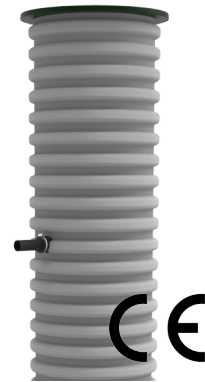
Item number: 223190727