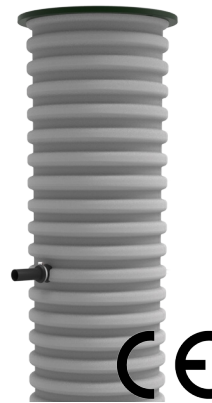
Item number: 223190725