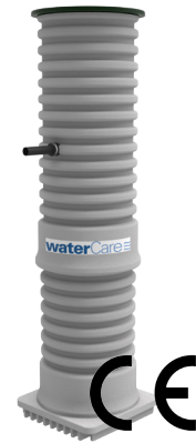
Item number: 223190720