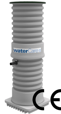
Item number: 223190715