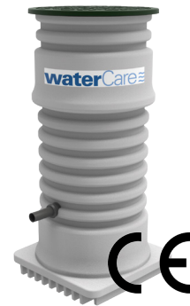
Item number: 223190710