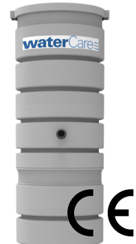
Item number: 223190626