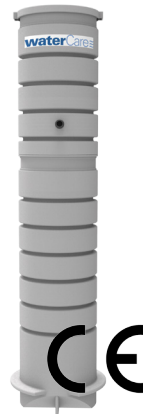
Item number: 223190620