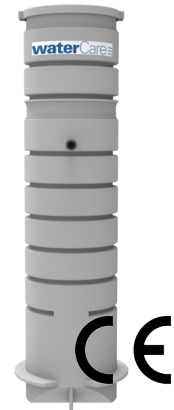
Item number: 223190619