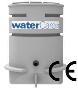
Item number: 223190607SK