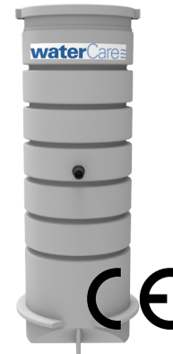
Item number: 223190605