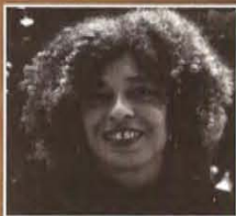
Angela Y. Davis

"In this extraordinary book, Angela Davis challenges us to confront the human rights catastrophe in our jails and prisons. As she so convincingly argues, the contemporary U.S. practice of super-incarceration is closer to new age slavery than to any recognizable system of 'criminal justice.'"