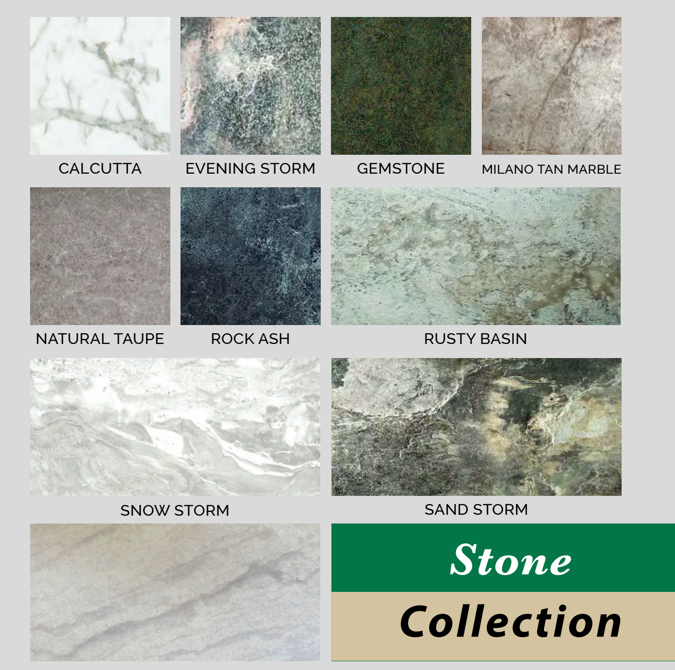
STONE CREST WHITE