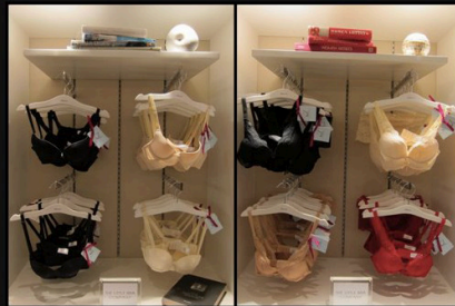
TLBC Collection is now available at Sheer (price range HK$290 - HK$490)

My customers also inspire me a lot. I thank them for taking the time to write to me and express their needs. This is how my collection has expanded and continues to grow. I try my best to create things that they really need. For example, developing C-cup bras on a TLBC's bra was requested from many customers. Now, we offer bras in sizes from 28A to 34C.