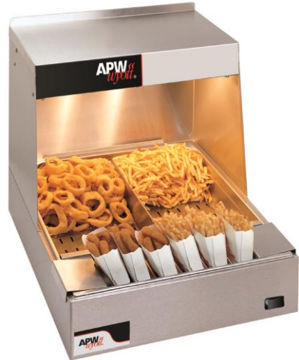
Model: Countertop Fry Holding Station CFHS-21