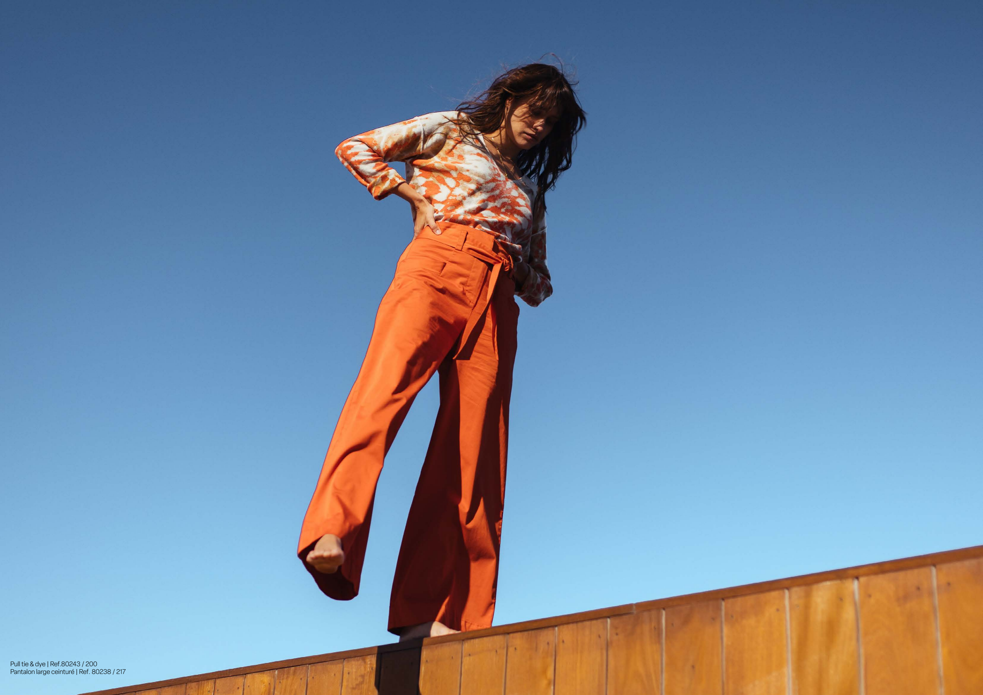
Pull tie & dye | Ref.80243 / 200 Pantalon large ceinturé | Ref. 80238 / 217