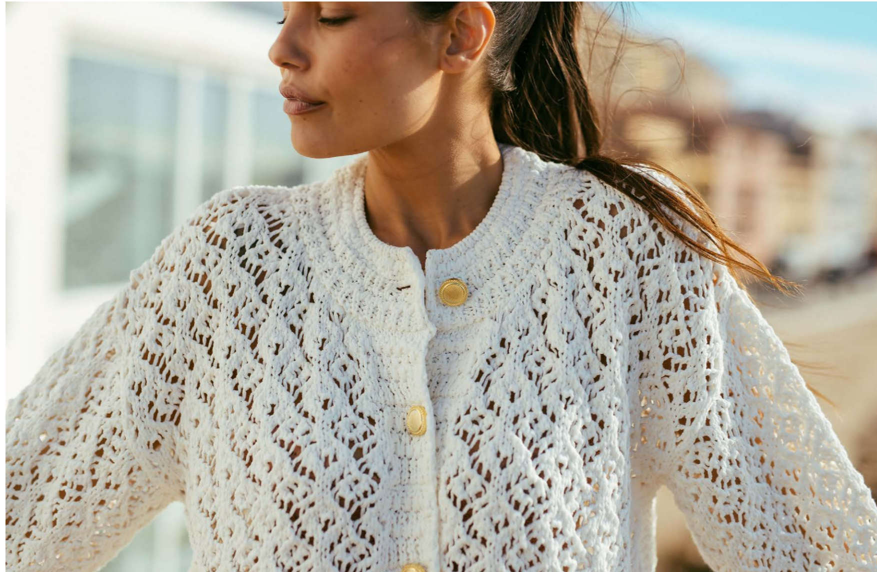
Cardigan | Ref. 80245 / 003