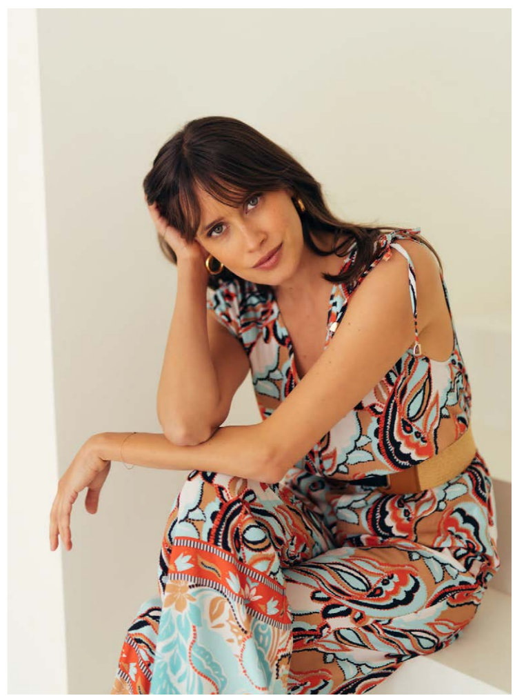
Combipantalon fluide | Ref. 80240 / 010 Veste lien coulissant | Ref. 80232 / 007