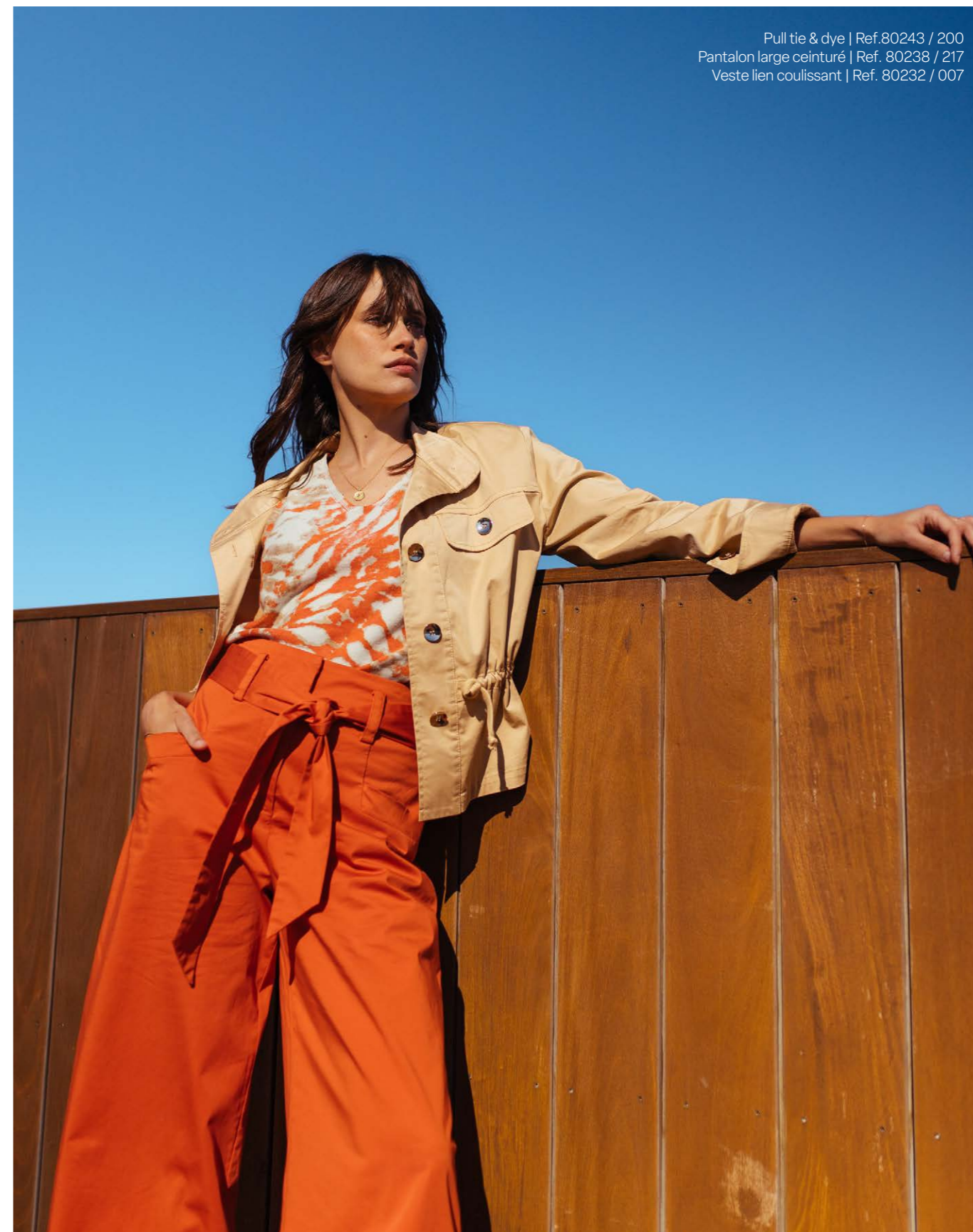
Pull tie & dye | Ref.80243 / 200 Pantalon large ceinturé | Ref. 80238 / 217 Veste lien coulissant | Ref. 80232 / 007