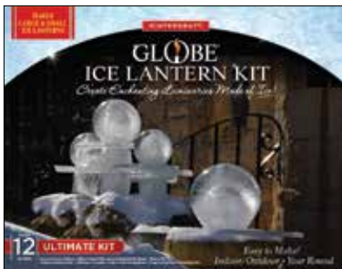
The Ultimate Kit For the Globe Ice Lantern enthusiast, this super kit makes 12 large or small Globe Ice Lanterns.

What should I do if the faucet heads are too big for the balloons?