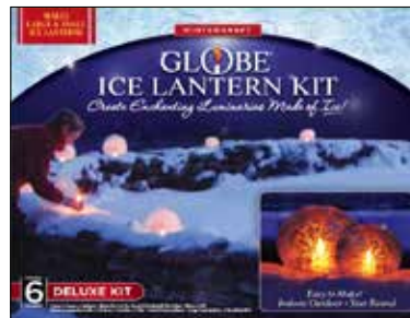
The Deluxe Kit Makes 6 Large or Small Globe Ice Lanterns.