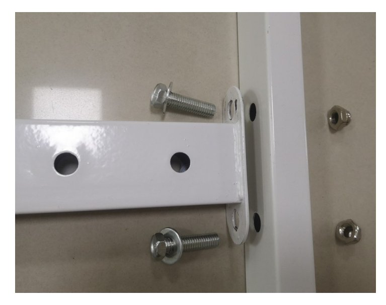
Step 3 Install the "white board holder" to the top of vertical pole with big nut