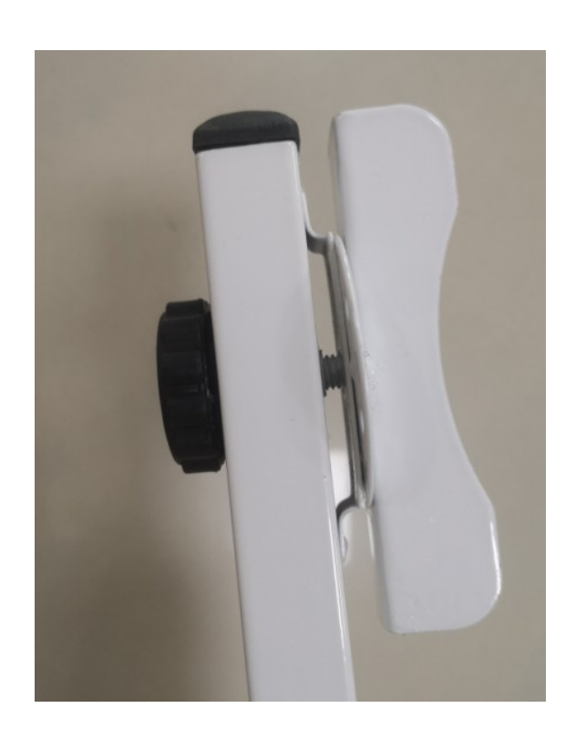
Step 4 Screw the telescopic poles and connect them with vertical poles with screws, one in the middle and one on the bottom